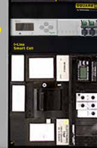
EM3555 meter shown installed in I-Line. The larger I-Line Smart Cell is the new Smart Systems Communications.